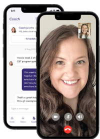
Dedicated health coach