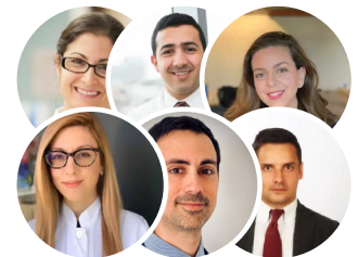
Expertise across medical specialties

90% OF MEMBERS FEEL BETTER AFTER GOODPATH CARE