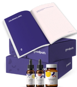
Physical treatments shipped to you